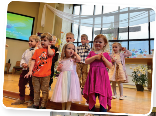
PreK Kids (future Joyful Noise)

Trinity Lutheran offers a wonderful opportunity for Children in Grades K-5 to participate in a weekly choir ensemble, which sings in worship once each month and several other special occasions. These groups rehearse Wednesdays with students able to take the bus from Orono Public Schools to the church. The singers share snack-time, then gather in rehearsal to explore their voices, make music, meet new friends, and share the gift of praise. Joyful Noise is made-up of K-2nd graders, and Youth Choir is 3rd-5th graders. Registration links can be found on the website or through Trinity Kids registration (text TK to Trinity).