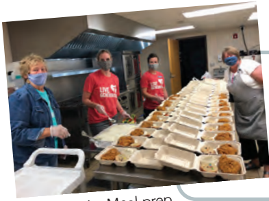
Community Meal prep

And what does the Lord require of you? To act justly, and to love mercy, and to walk humbly with your God.