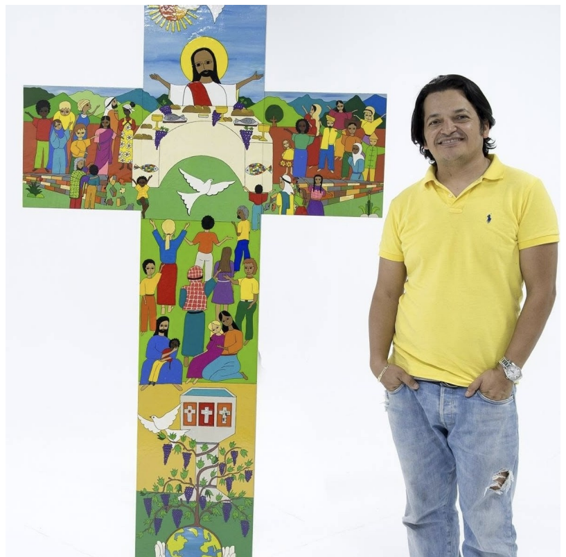
Christian and cross for 500 th Reformation Anniversary