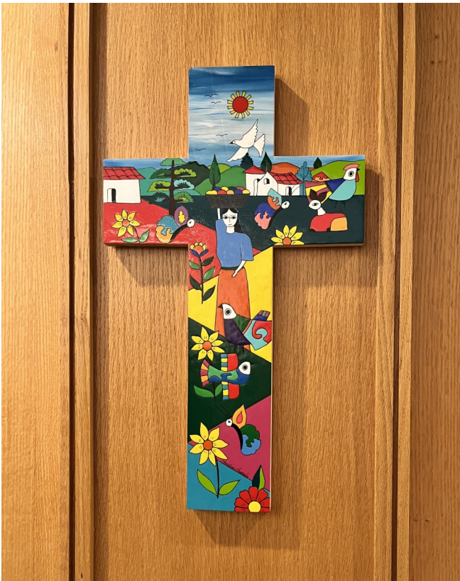
Cross at Our Saviors Lutheran