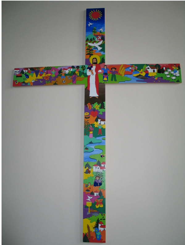
Cross at Family of Christ